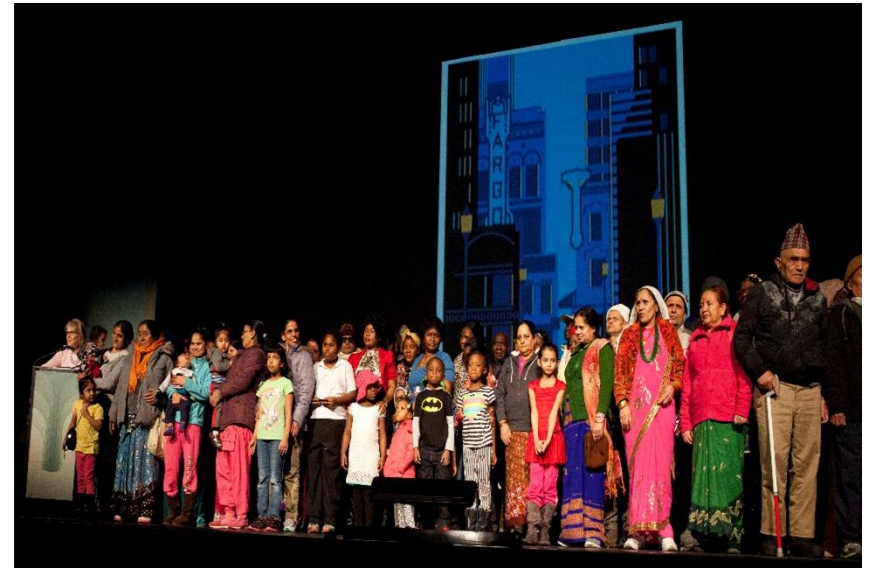
Growing Together MLK Award 2015